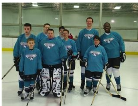
Special Needs Hockey Team